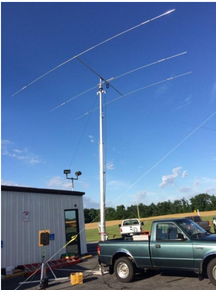
Mosley TA-33 Jr. on US Tower ALM31