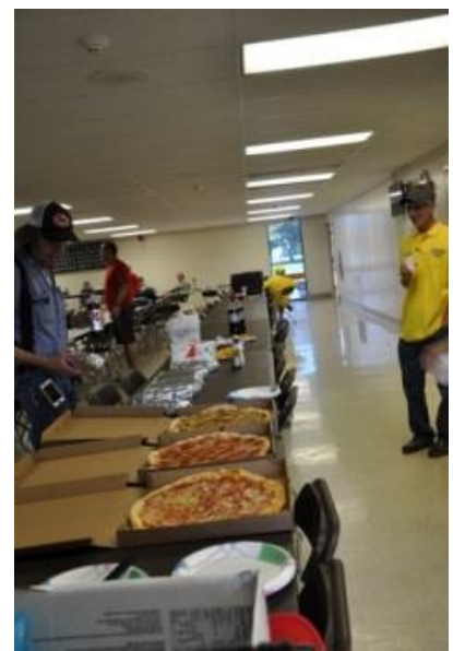
Pizza and Subs for Lunch