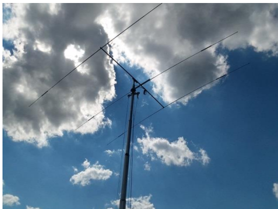
Antenna on a sunny day