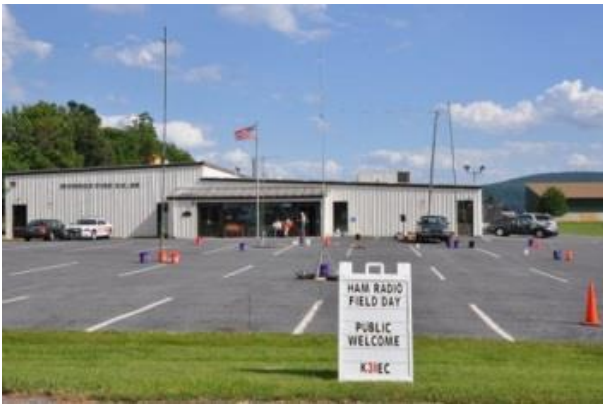
Field Day 2017 Location: Monroe Fire Company 25.