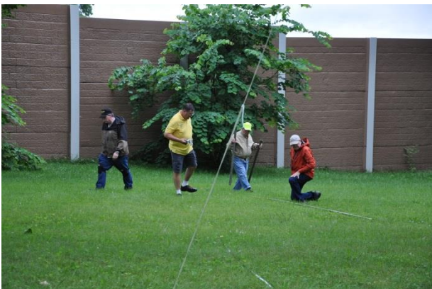
Antenna Crew raising masts for the 75 Meter Dipole