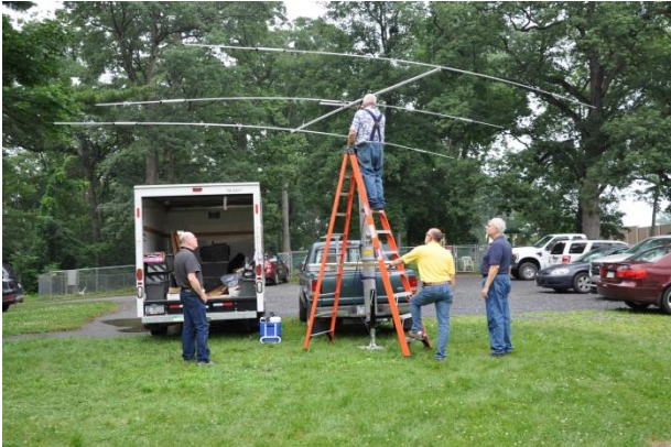
Mosley TA-33 Jr. on US Tower ALM31